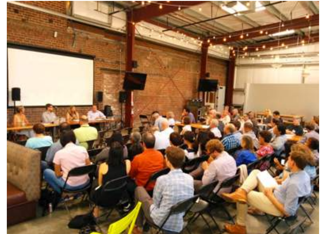
The CPR meeting held at the San Pedro Square, a creative retail/restaurant space, drew members of the APA CA Northern Section.

A recap of this meeting can be found in the September 2014 issue of Northern News http://norcalapa.org/wp-content/uploads/2014/08/Sept14.pdf#page=16