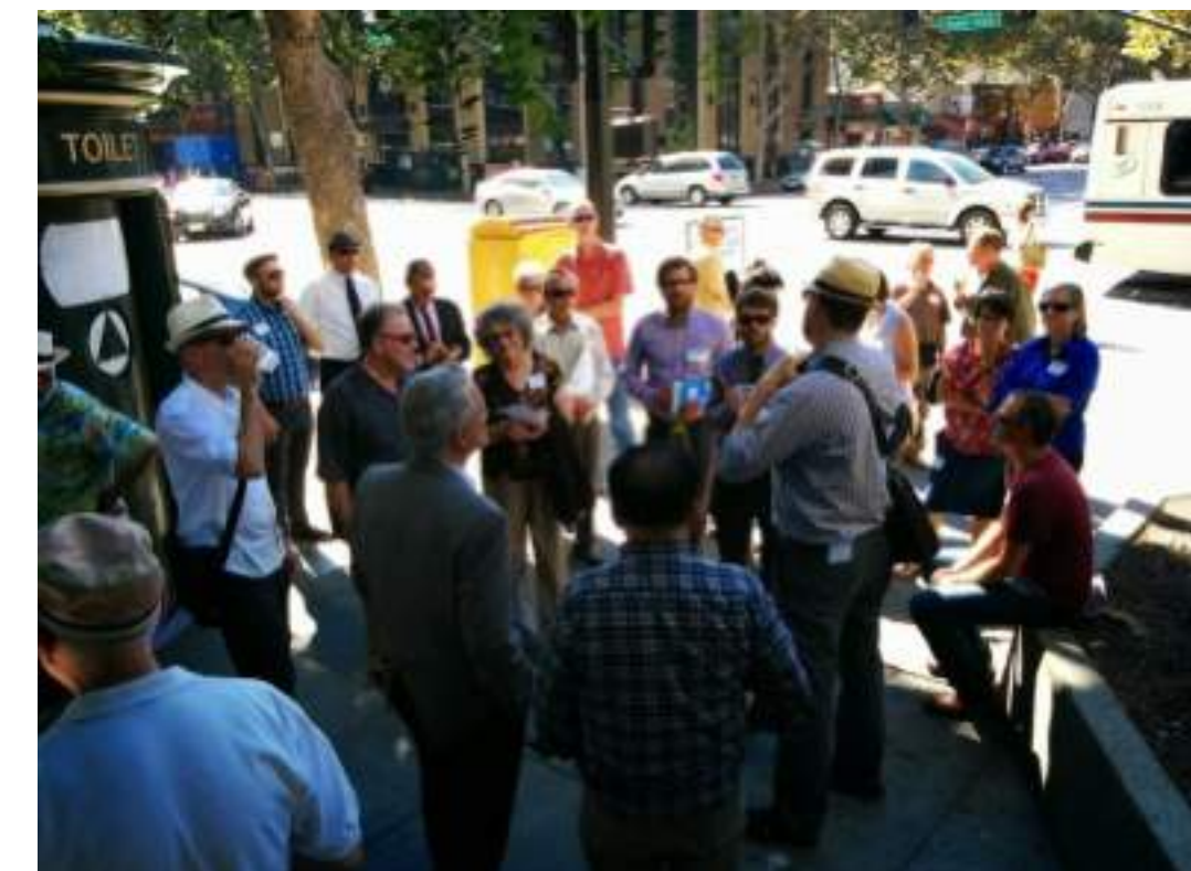
The program also included a downtown walking tour.