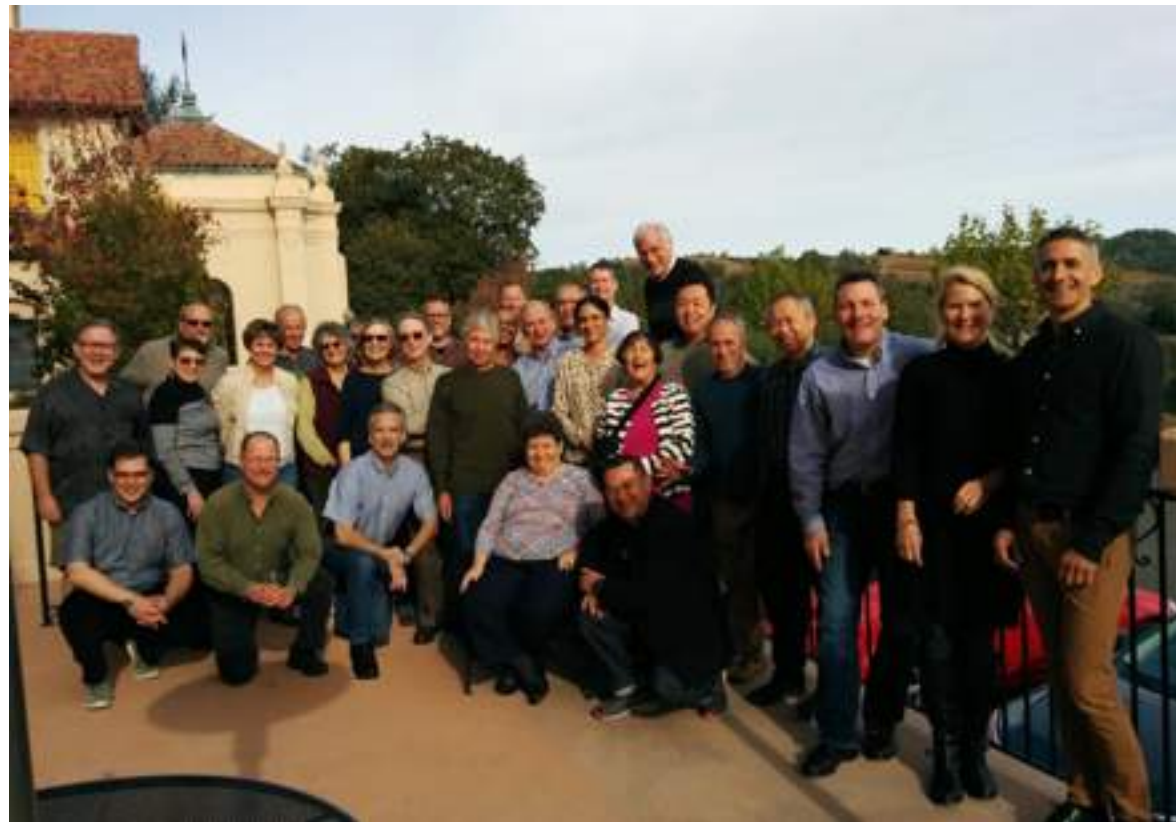
CPR Members enjoyed a productive annual retreat at the delightful Mount La Salle Conference Center near Napa.